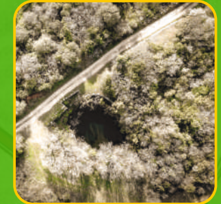
Lokva Fontana - Laco Fontana