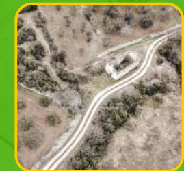
Sv. Toma' - S. Toma'